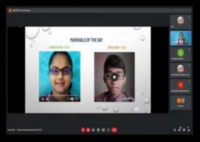
Marshals of the Day